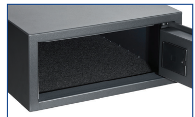
Carpet Lined Interior Base