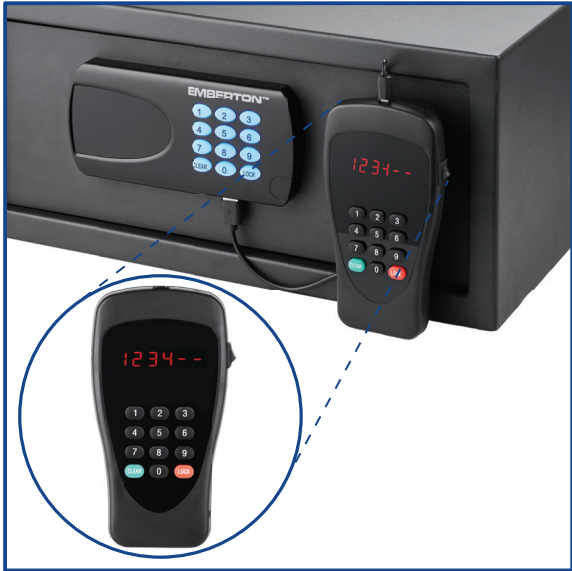
CEU Slot - Optional Audit Trail Reader