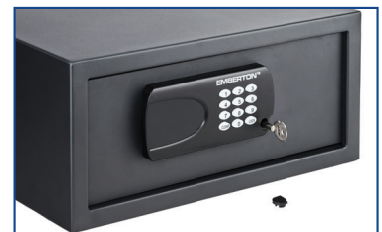
Override Key Included for Emergency Use