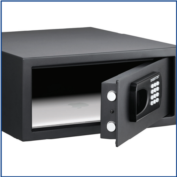
15" & 17" Model is Easy to Store Widescreen Laptops