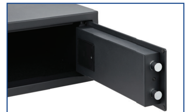
Motorised Locking System